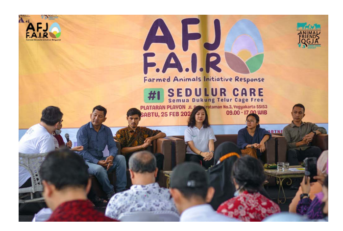
F.A.I.R - A festival in Indonesia that gathers corporates, government, farmers, academics, NGOs, and members of the public for talkshows, entertainment, and a bazaar

online training as farmers emerged from the pandemic. <sup>[74]</sup> The Institute also developed a seven-module course on the basics of cage-free farming developed by Global Food Partners to its e-learning platform. <sup>[75]</sup>