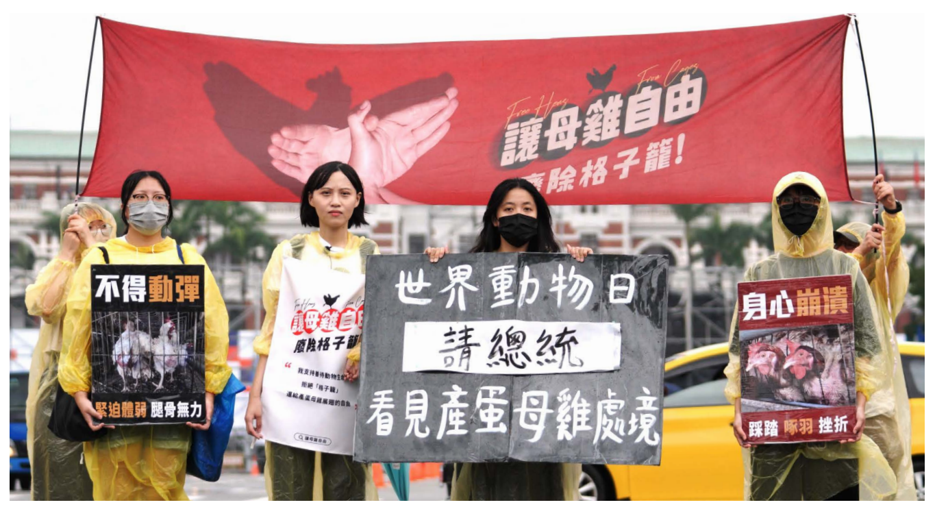
Activists hoist placards outside Taiwan's presidential office on World Animal Day in 2023

According to International Egg Commission data (2020), East Asia accounts for 33% of the world's commercial laying hens, with China alone home to almost 30% of the global flock. [17] In all of the countries and regions surveyed in East Asia, the proportion of layer hens raised in cage-free housing currently accounts for less than 10% of the overall laying flock.