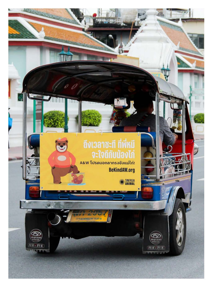
A tuk tuk ad exclaims "Please say goodbye to cages for hens!" in Thailand

Three countries within SEAANZ received points for meeting some of the Benchmark's four criteria related to welfare during slaughter or killing through mandatory standards, with New Zealand meeting three, Australia two, and Thailand one. Australia, Indonesia, and the Philippines also received points for meeting some criteria through voluntary standards, with the Philippines meeting three criteria and Australia and Indonesia one criterion each. According to a 2023 report on farmed animal welfare in Southeast Asia, chickens constitute 96% of all land animals slaughtered in South East Asia, highlighting the importance of slaughter protections for chickens in the region. [102]