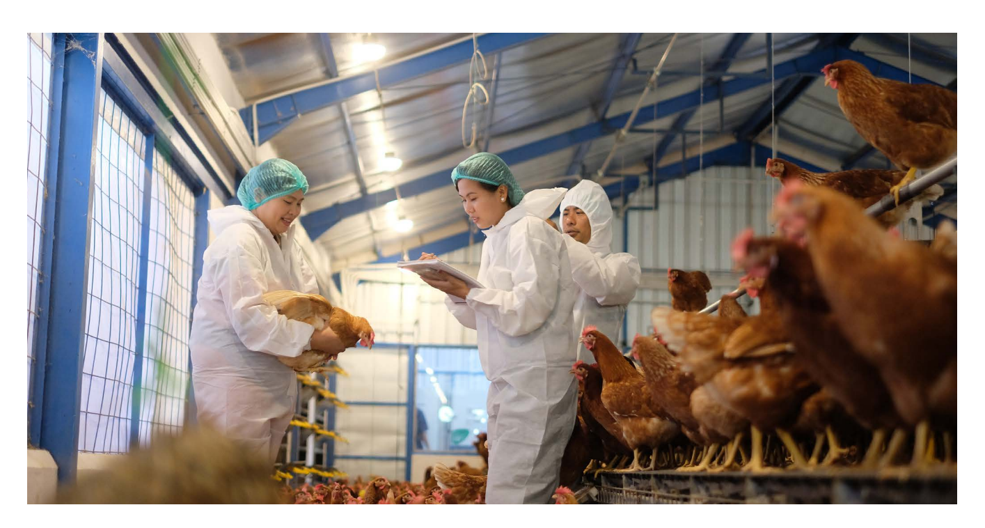
Training at a model cage-free farm in Indonesia led by Global Food Partners and Universitas Gadjah Mada

Indonesia and the Philippines both provide technical training and support for cage-free farmers. In Indonesia, the government-run Gadjah Mada University has inaugurated a model farm and training center in partnership with Global Food Partners. The facility provides training in cage-free management and production for farmers. The government has also funded training for free range farming at the village level delivered by female farmers group Kelompok Wanita Tani. [73] In the Philippines, the Agricultural Training Institute partnered with Animal Kingdom Foundation to provide