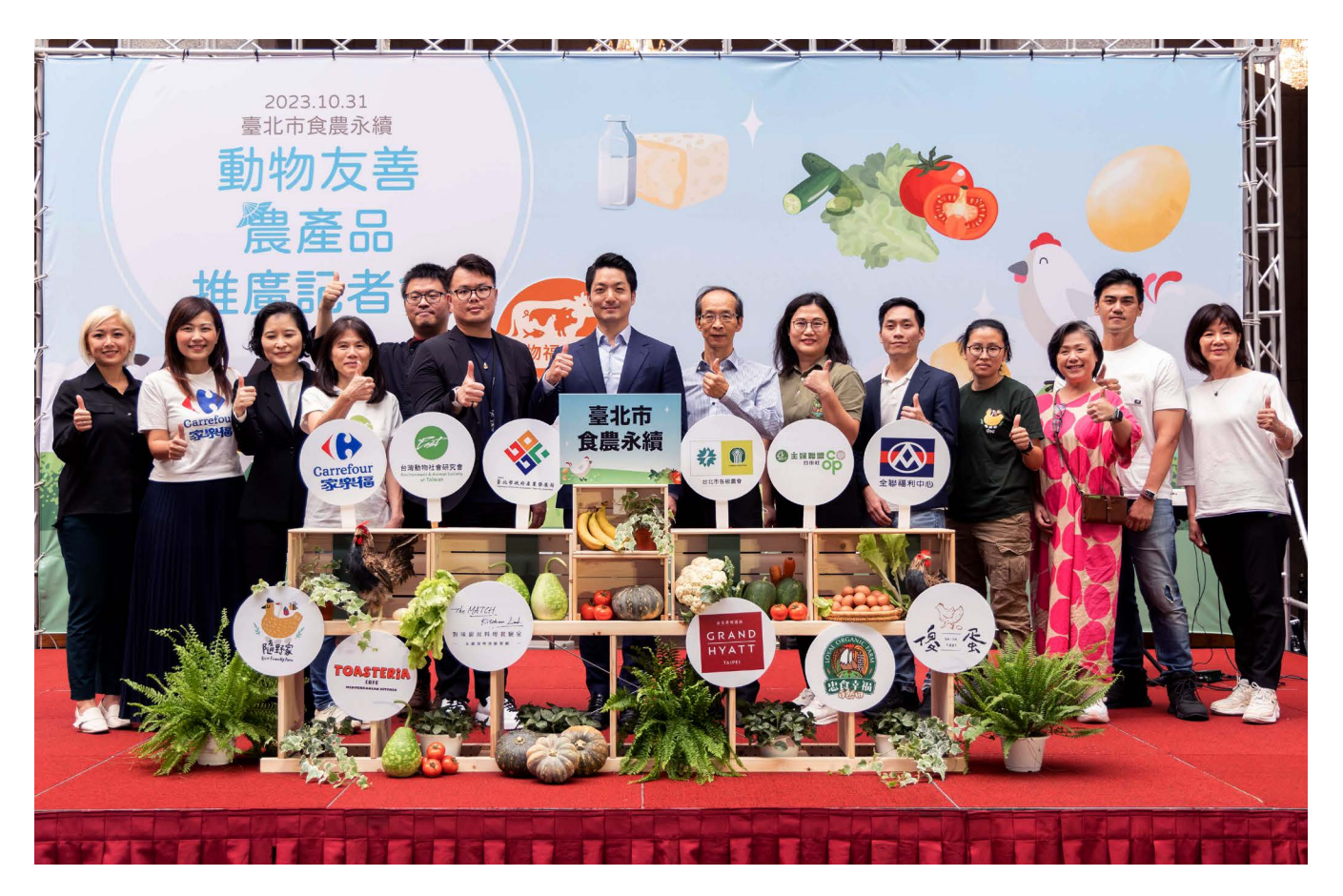
Taipei City announces it will begin sourcing cage-free eggs in school lunches alongside animal-friendly businesses